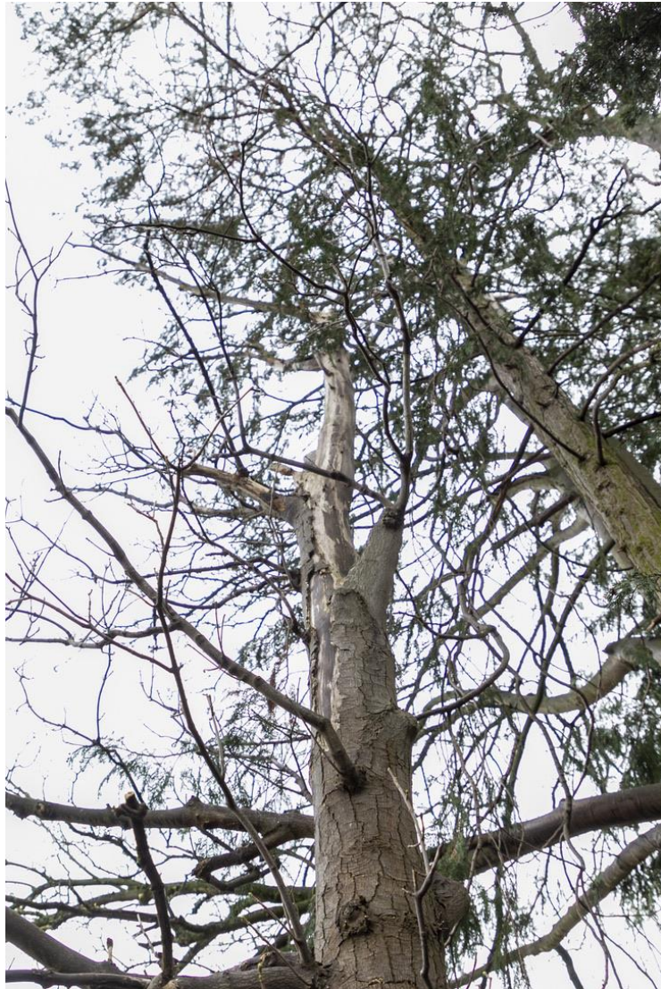
T1 Sycamore appears to be severely diseased