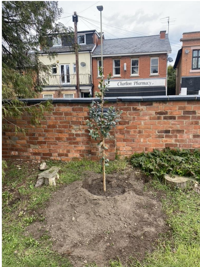
Arbutus unedo (recently planted)