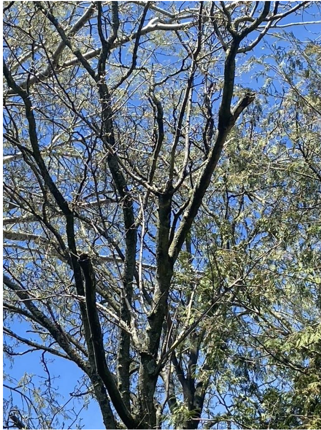
T3 Sycamore – appears to be diseased with several large boughs having died and fallen.