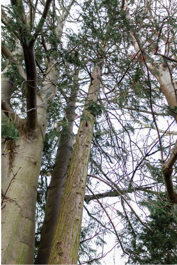
T2 Lawson Cypress is poor specimen with sparse greenery