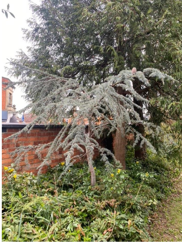
Atlas Cedar (to be relocated)